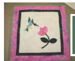
Finished Wall Hanging

Did you know dancing is good for your brain, your bones and even your relationships?